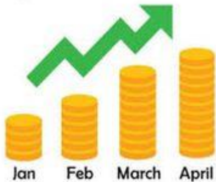
Systematic Investment Plan