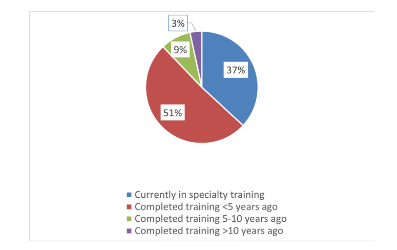
Figure 1b. Career phase 2023 Exam candidates.

Figure 1a. Number of candidates per year of completion of specialty training.